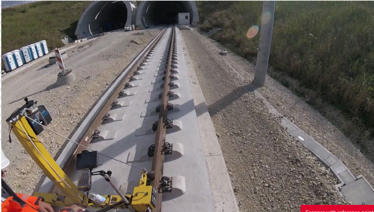
Scanner with reference point