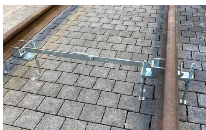
RhoPPS Pre-Positioning System

The optimal single support point for slab track.