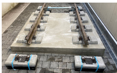
LVT & LVT-HA Slab Track

Reinforced bi-block sleepers in in-situ cast track concrete layer.