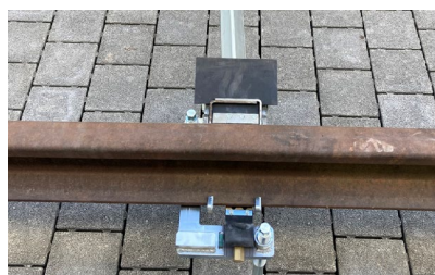
RhoFAS Fine Adjustment System