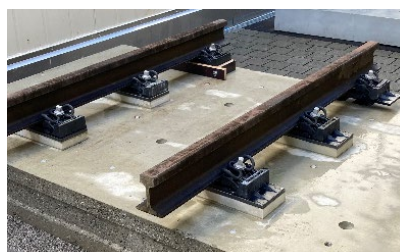
Single support points in precast concrete slab (IVES modification) Bergünertunnel