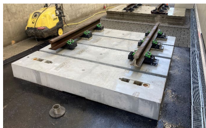
IVES Slab Track

// Showing track competence – Product Overview