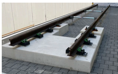
Direct fixation (Single support points)

The optimal single support point for slab track.