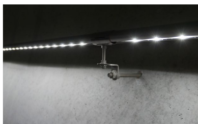
LED-Handrail/handrailLIT and Tunnel lighting Orientation and Guidance System