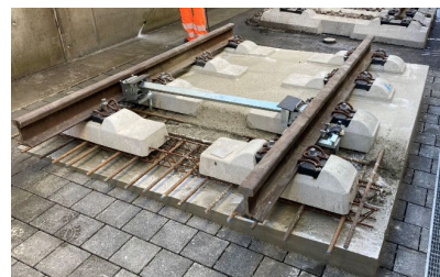
RHEDA 2000 Slab Track

Prestressed wide sleepers on asphalt support layer.