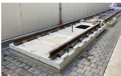
ÖBB-Porr (Slab Track Austria) Slab Track